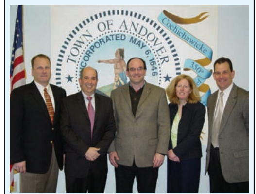
The Andover Board of Selectmen