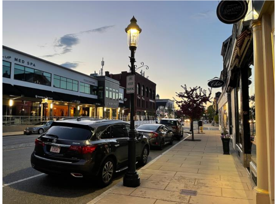
Andover Main Street at Dusk Lit by 100% Sustainable LED Streetlights (K. Margolese)