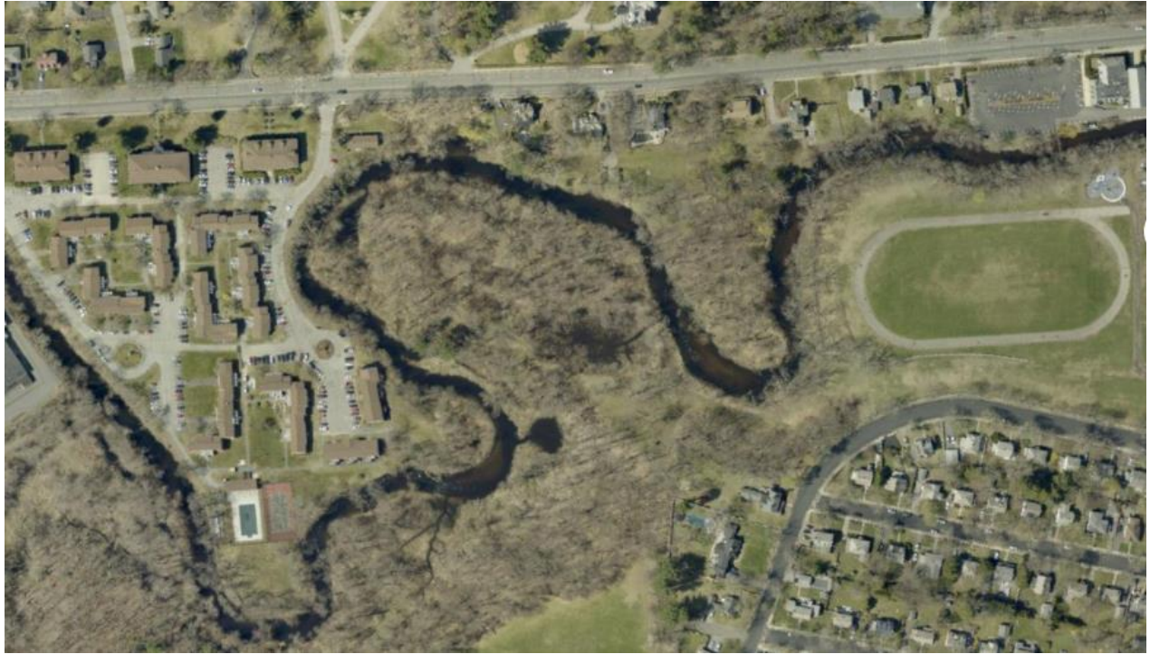
Serpentine Shawsheen, Subject of Andover's Municipal Vulnerability Preparedness Grant